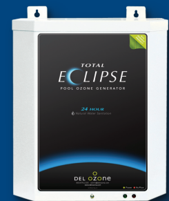
Total Eclipse™ 2 & 4

The Total Eclipse™ is the ultimate ozone generator for in-ground pools up to 50,000 gallons (primary) to 100,000 (supplemental). It has a built-in circulation pump for quiet, continuous 24-hour operation independent of all other pool equipment. Because it operates continually, it reduces chlorine use even further, more than any other ozone generator on the market, for fresh, pure water all day, every day.